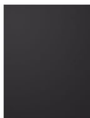
Basic Black 8-1/2" X 11" Cardstock $8.00