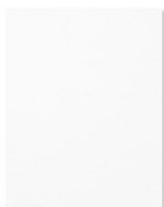
Whisper White 8-1/2" X 11" Cardstock $9.00