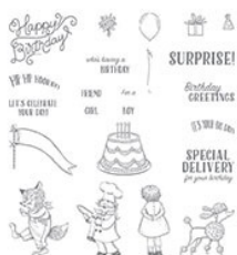
Birthday Delivery Photopolymer Stamp Set $27.00