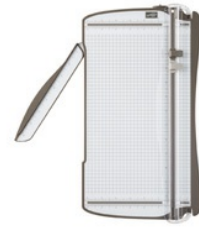
Stampin' Trimmer $30.00