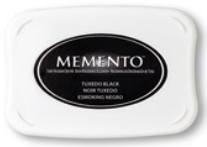
Tuxedo Black Memento Ink Pad $6.00