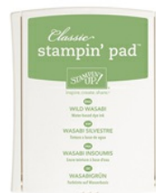
Wild Wasabi Classic Stampin' Pad $6.50