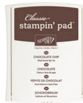
Chocolate Chip Classic Stampin' Pad $6.50