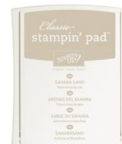
Sahara Sand Classic Stampin' Pad $6.50