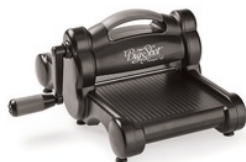
Big Shot $110.00