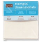
Stampin' Dimensionals $4.00