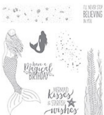
Magical Mermaid Clear-Mount Stamp Set $20.00