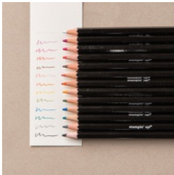
Watercolor Pencils $16.00