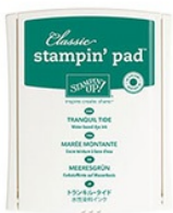
Tranquil Tide Classic Stampin' Pad $6.50