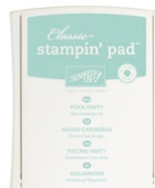
Pool Party Classic Stampin' Pad $6.50