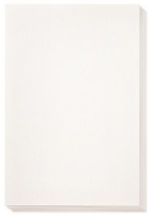
Watercolor Paper $5.00