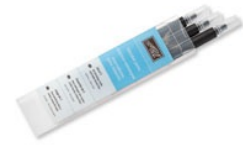
Blender Pens $12.00