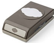
Pretty Label Punch $18.00