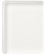
Clear Block E $12.00