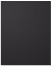
Basic Black 8-1/2" X 11" Cardstock $8.00