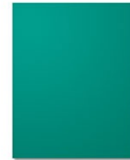
Tranquil Tide 8-1/2" X 11" Cardstock $8.00