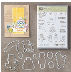
Birthday Delivery Photopolymer Bundle $62.00