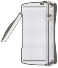
Stampin' Trimmer $30.00