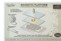
Magnetic Platform $40.00