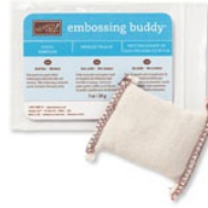
Embossing Buddy $6.00