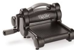
Big Shot $110.00