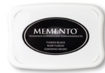
Tuxedo Black Memento Ink Pad $6.00