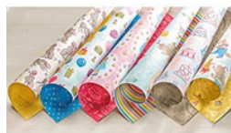
Birthday Memories Designer Series Paper $11.00