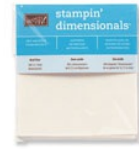
Stampin' Dimensionals $4.00