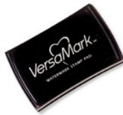
VersaMark Pad $8.50